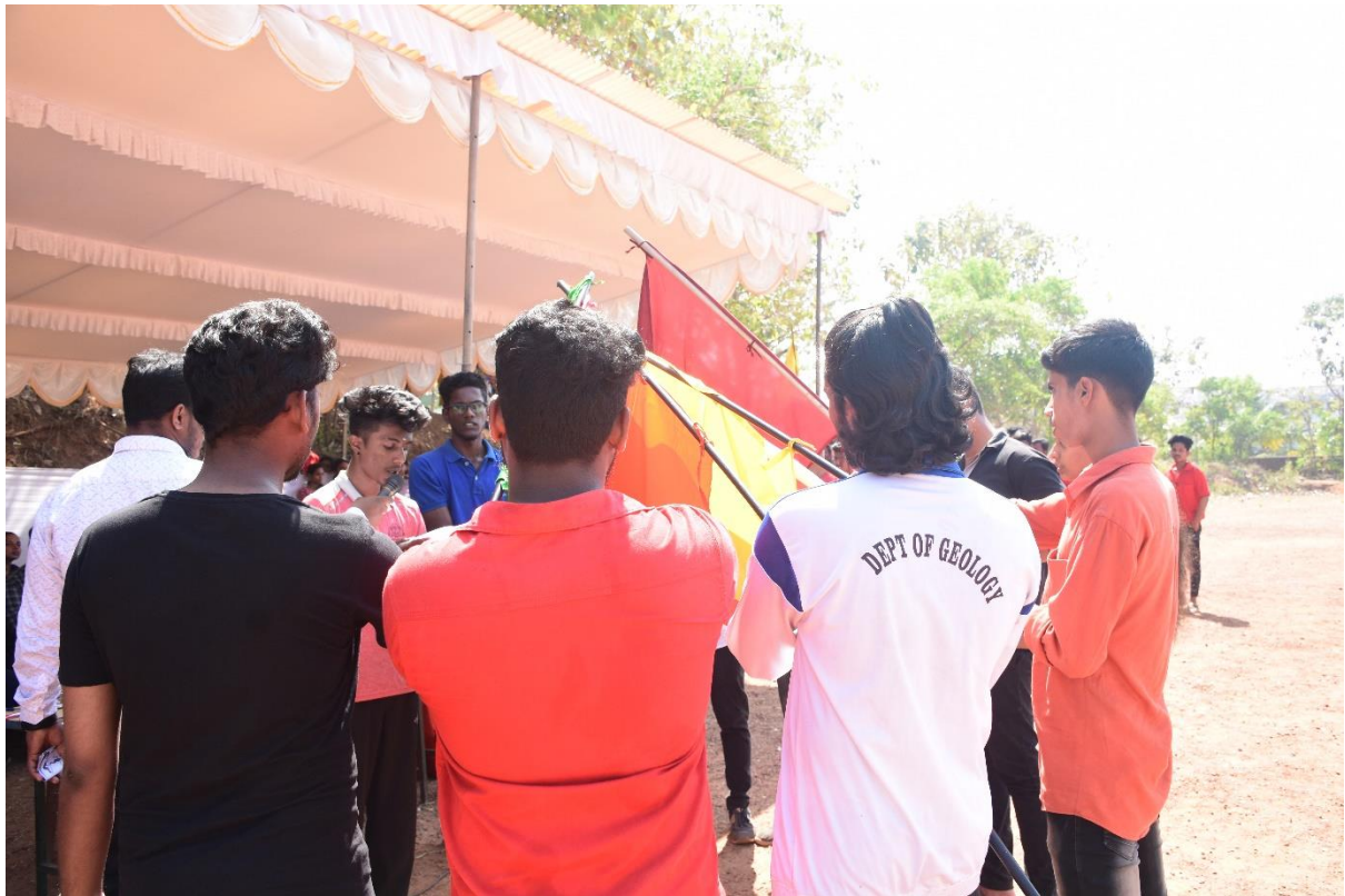
Oath taking by students