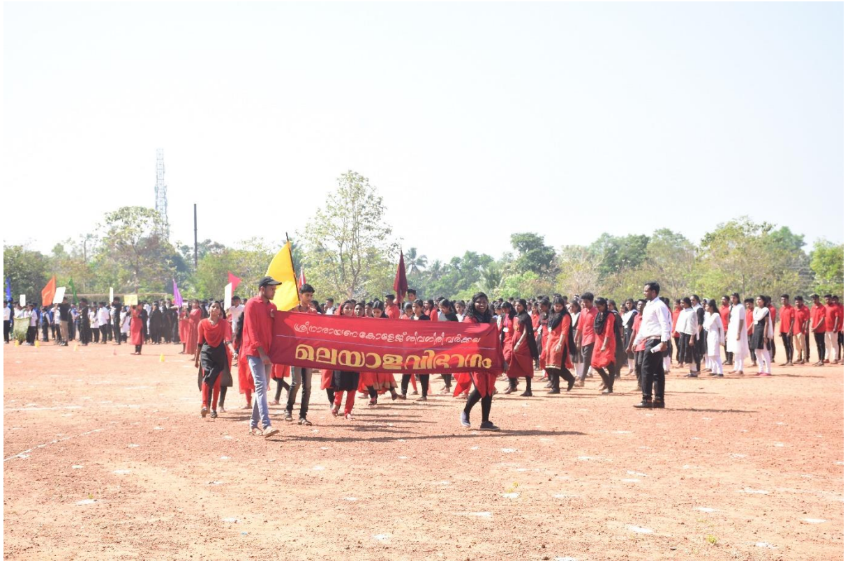
March Past By Students